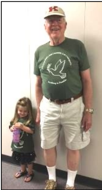
80 years separate the oldest & youngest members of our team!