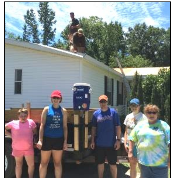
MONDAY ...first day on work