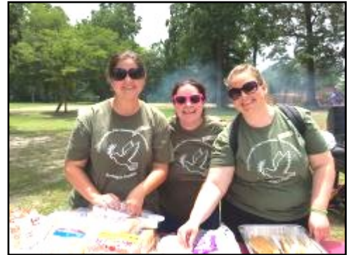
SUNDAY ...worshipped with Tar River Community Church & helped with Community Day at the park.